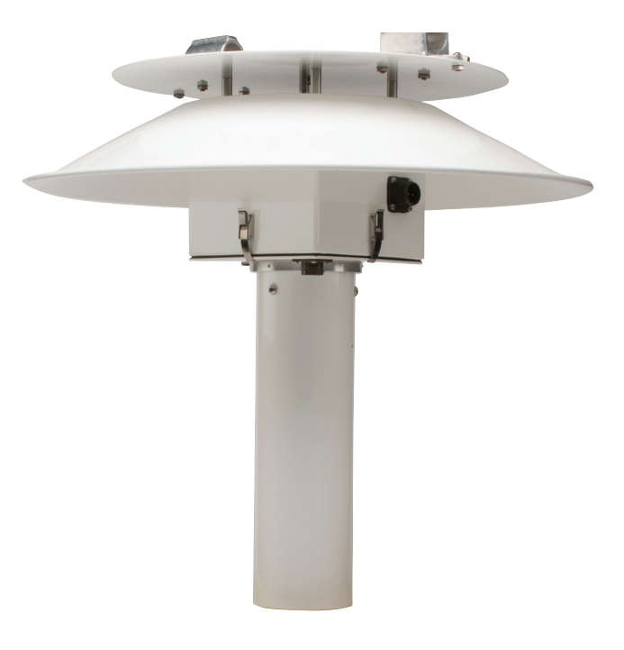
076B Fan Aspirated Radiation Shield