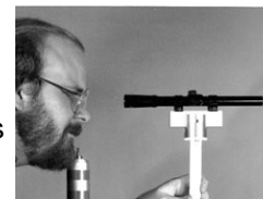
Typical Sighting Fixture

This measurement is made using either a surveyed marker that has been put at a location that is TRUE North of the sensor, or by determining magnetic North and then using the declination value for the specific part of the country to find TRUE North. An orientation compass such as the 820510 is recommended for it's accuracy and ease of use. For surveyed or identified markers at a distance from the sensor the 042, OF-201 and 17-50 are used for the different type of wind direction sensor mountings.