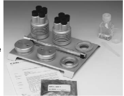
Calibrator Model 3226

For field applications, a two point measurement can be made using the Model 3226 Humidity Calibrator. It uses the operating principle on the fact that a saturated salt solutions generates a certain relative humidity in the air above it. The reading of the humidity probe or transmitter can then be checked for