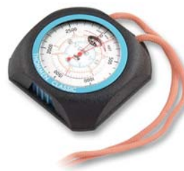
Hand Held Barometer And Altimeter

Checks of the barometric pressure can be made by comparison with a mercury barometer, or from another local source of absolute pressure.