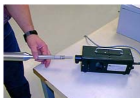
049 Wind Speed Calibrator

sensor. When operated from 50 Hz the output is 250 and 500 rpm. They work directly with all sensors except the 034A/B which requires an additional 6666 Adapter. The Model 053 wind speed calibrator uses a digitally controlled motor that has an output of from 100 to 10,000 rpm, it is battery or AC powered.