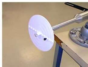
050 Torque Wheel