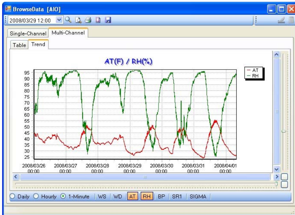
Multiple Channel Chart Display from Air Plus Software